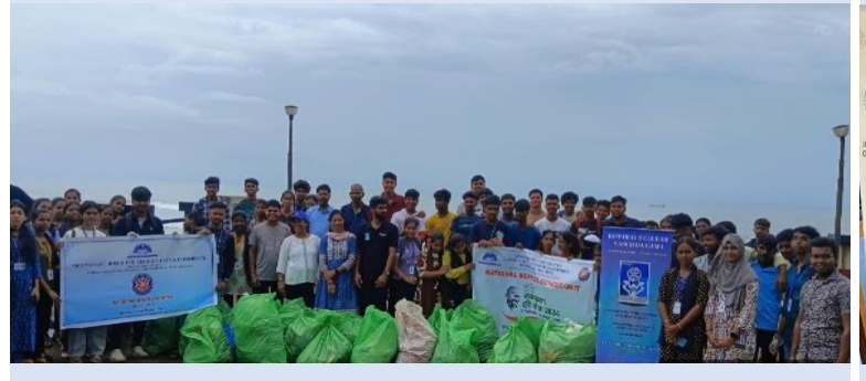
Bogmolo beach cleaning by NSS students in collaboration with Rotary Club