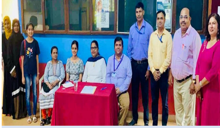
Voters registration camp