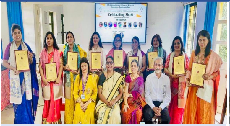
Naari Shakti Alumni felicitation