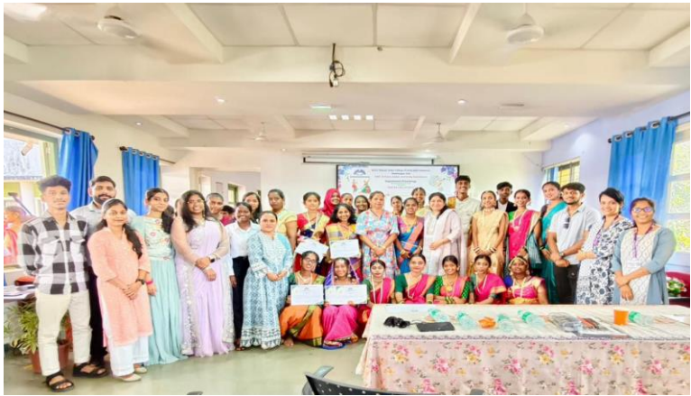
'Socio Creations' by the Department of Sociology