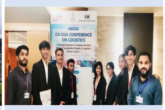
TYBBA (Shipping & Logistics) students attended 10<sup>th</sup> Edition of CII Goa Conference on Logistics