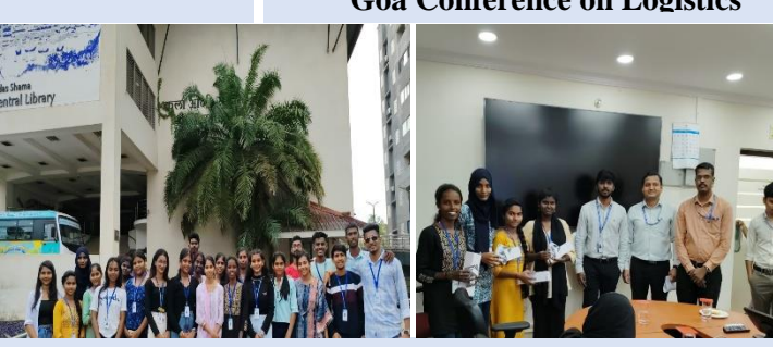
Banking students of TYBCom div D visited RBI office Patto Panjim, Krishnadas Shama State Central Library, Patto Panjim.