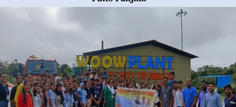
Industrial visit to Faber castell at Corlim, Waste management plant, Chicalim and Kulagar at Keri-Ponda organised by Nature club and Resource management cell for sustainability along with Department of Commerce and Department of Environmental studies