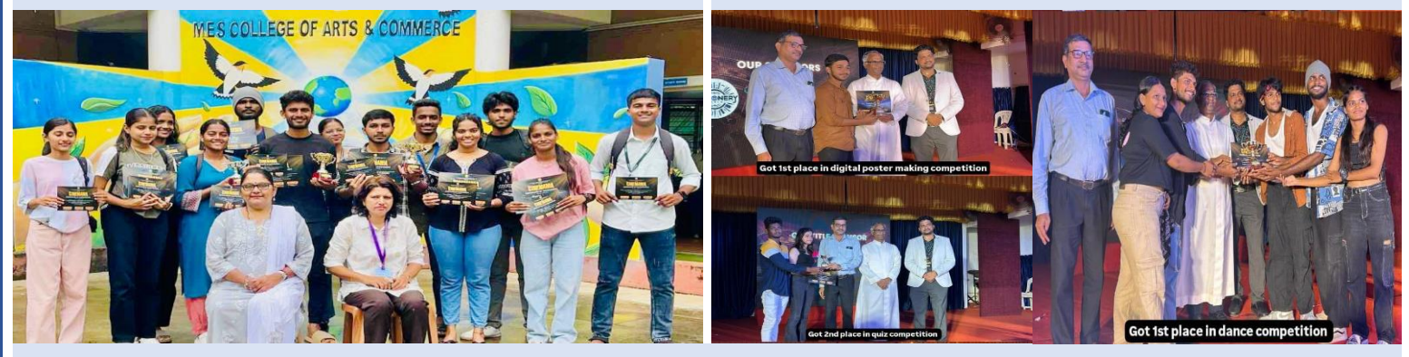
M.E.S. Vasant Joshi College secured first position in dance and poster making, and second position in quiz competition at Cinemania event organised by Don Bosco College

Our students secured first position in Fashion show, Pallette of colors and second position in Destination Marketing at the event Entrada '24 organised by Rosary College of Commerce and Arts, Navelim-Goa