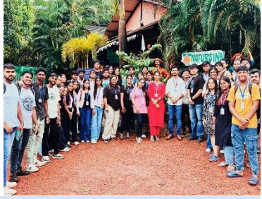
Industrial Visit to Kineco Ltd., Pilerne Industrial Estate, Goa and Adventure Visit to Nature Inn Farm, Nanoda by department of Commerce