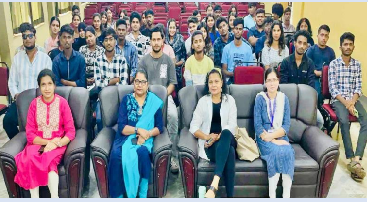
Session on Social Skills for BBA students