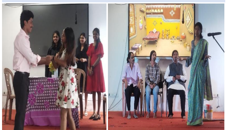
Enactment of plays by the students of BA Semester III English Skill Enhancement Course 'Text and Performance in English'