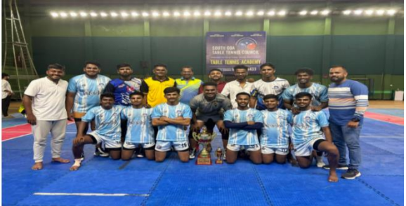
Runner's Up at the Invitational Kabaddi Tournament organised by Damodar Sports Club at SAG Indoor Hall, Fatorda