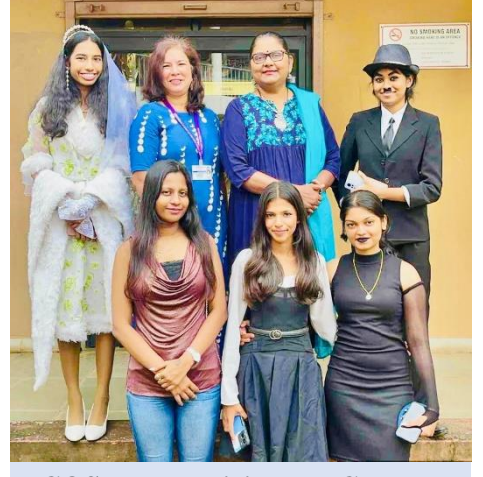
COS play participants- Campus Craze Fest organised by Psychology department