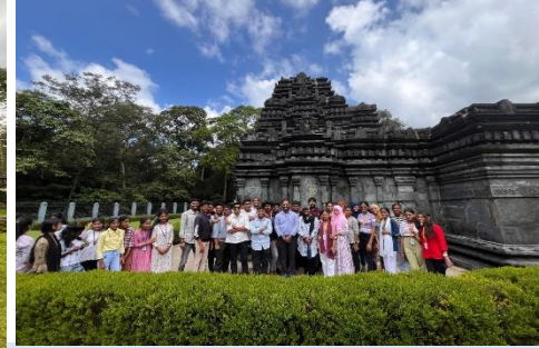
Field Trip to N V Eco farm, Tamdi Surla, and OPA treatment plant organised by the Department of English