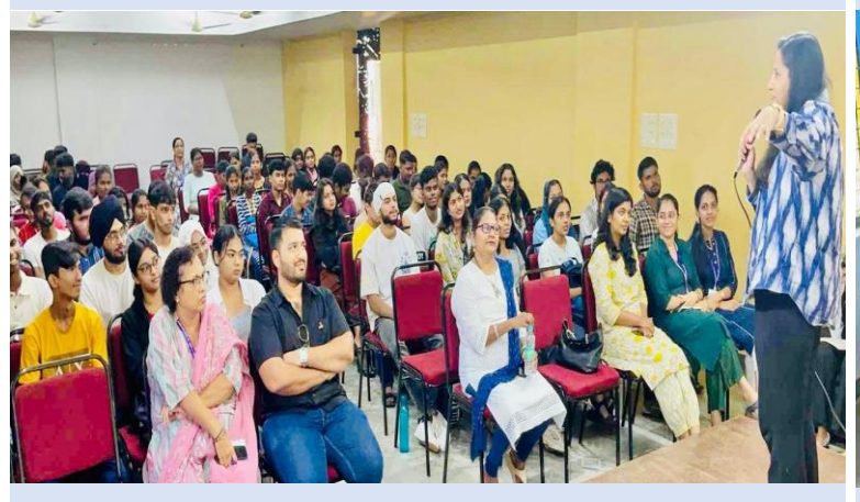
Session on 'Be a job creator rather than a job seeker' in collaboration with CII YI and Entrepreneurship club