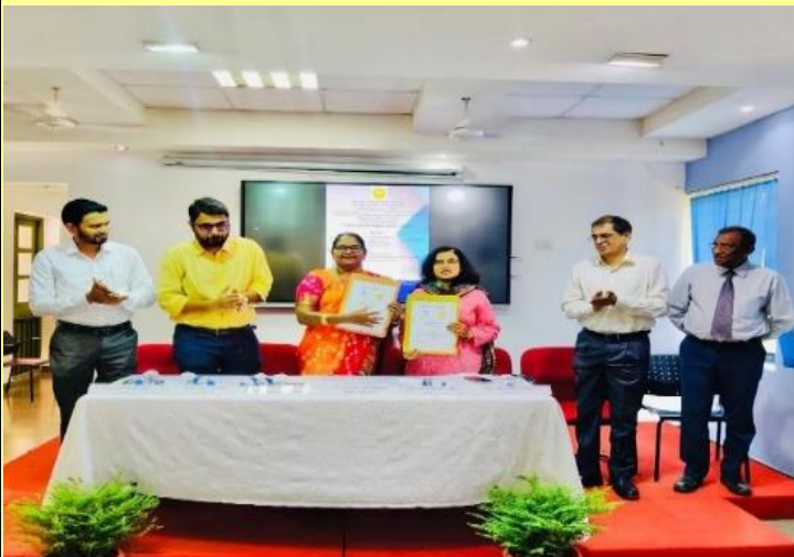
MOU between GCCI and M.E.S. Vasant Joshi College of Arts & Commerce