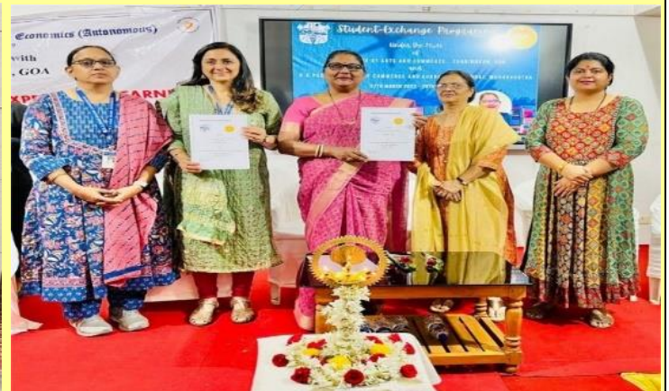
MOU between Podar College, Mumbai and M.E.S. Vasant Joshi College of Arts & Commerce