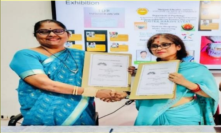
MOU between Dyanvardhini Divang Training College of B.Ed. for Special Education and M.E.S. Vasant Joshi College of Arts & Commerce