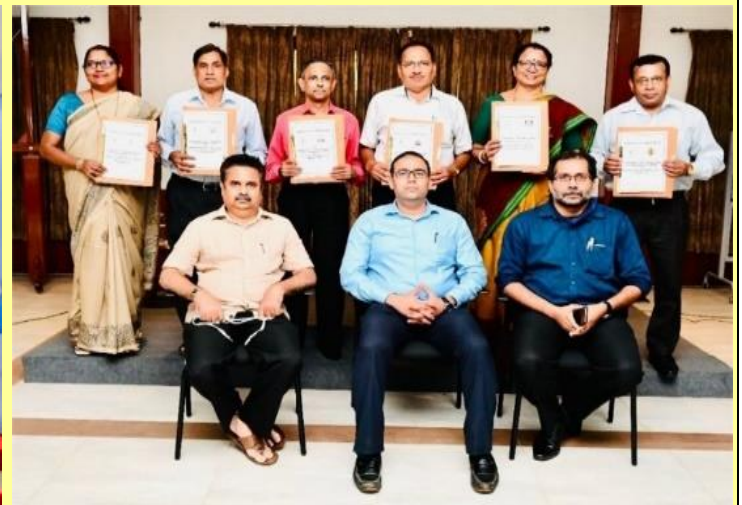
MOU between GIPARD and M.E.S. Vasant Joshi College of Arts & Commerce