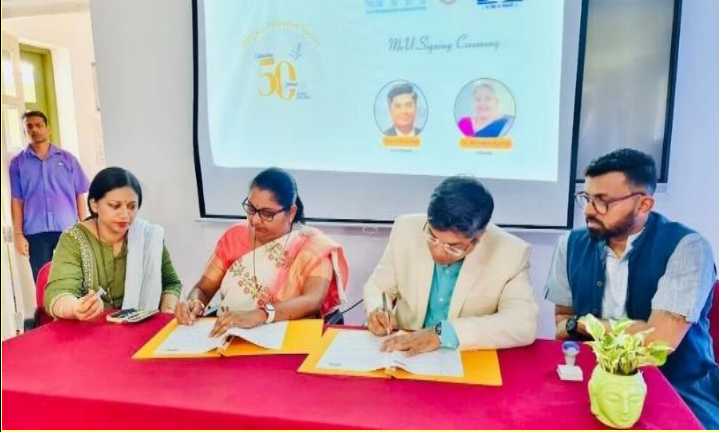
MOU between GTA and MES's Vasant Joshi College of Arts & Commerce