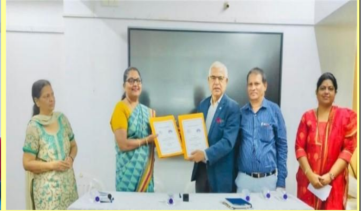
MOU between GMA and MES's Vasant Joshi College of Arts & Commerce