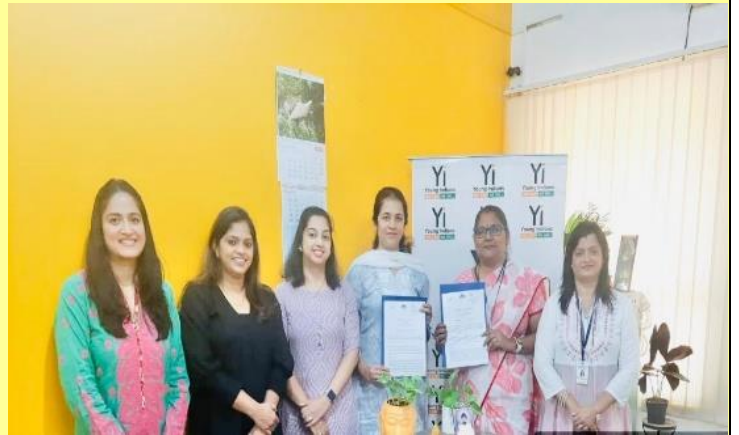
MOU between CII-YI and MES's Vasant Joshi College of Arts & Commerce