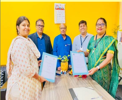
MOU between Lions club of Cortalim and M.E.S. Vasant Joshi College of Arts & Commerce