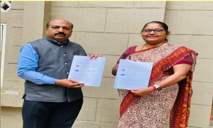
MOU between Poona College of Arts, Commerce & Science and MES's Vasant Joshi College of Arts & Commerce