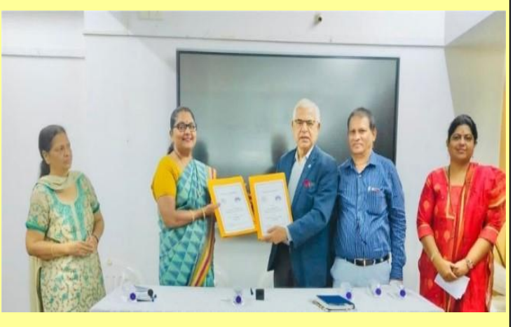
MOU between GMA and MES's Vasant Joshi College of Arts & Commerce