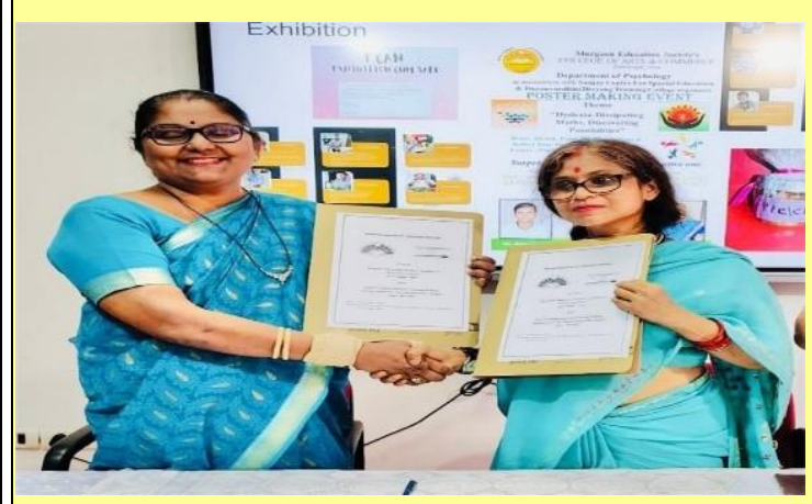
MOU between Dyanvardhini Divang Training College of B.Ed. for Special Education and M.E.S. Vasant Joshi College of Arts & Commerce