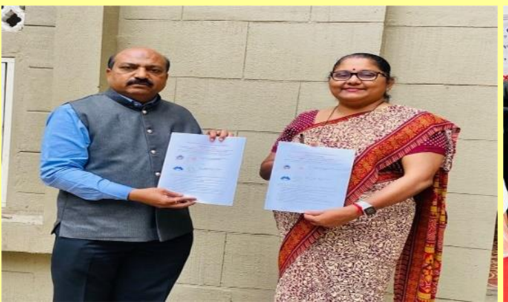
MOU between Poona College of Arts, Commerce & Science and MES's Vasant Joshi College of Arts & Commerce