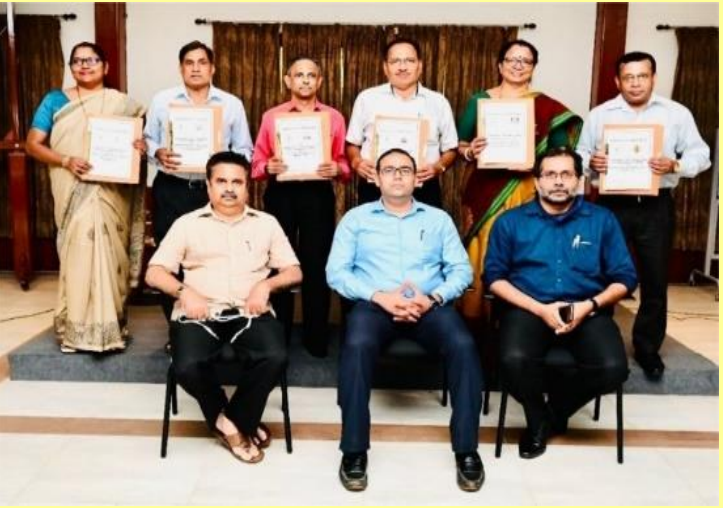
MOU between GIPARD and M.E.S. Vasant Joshi College of Arts & Commerce