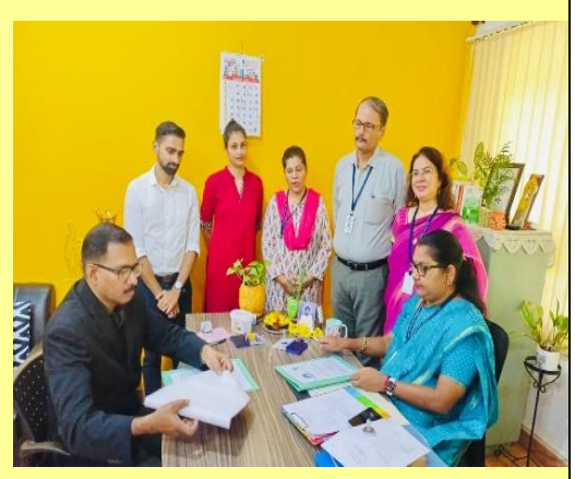
MOU between Mindcraft and M.E.S. Vasant Joshi College of Arts & Commerce