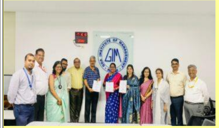
MOU between GIM and M.E.S. Vasant Joshi College of Arts & Commerce