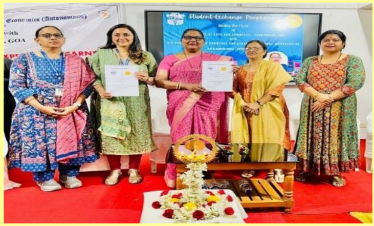
MOU between Podar College, Mumbai and M.E.S. Vasant Joshi College of Arts & Commerce