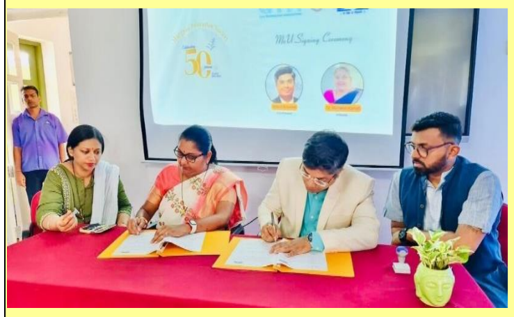
MOU between GTA and MES's Vasant Joshi College of Arts & Commerce