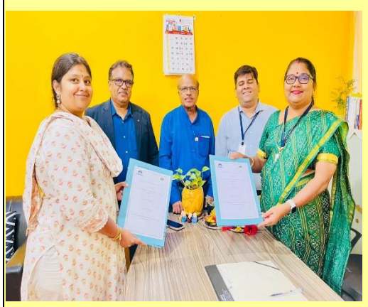
MOU between Lions club of Cortalim and M.E.S. Vasant Joshi College of Arts & Commerce