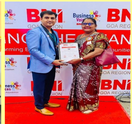
MOU with Business Network International