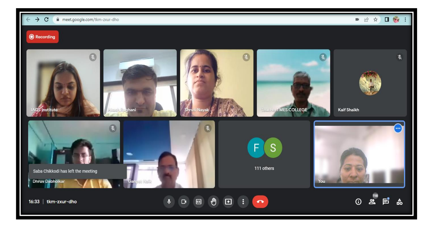
Participants of the session