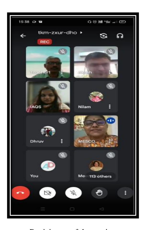
Participants of the session