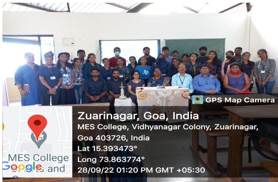
Group photo of the participants of inaugural function/Introductory session