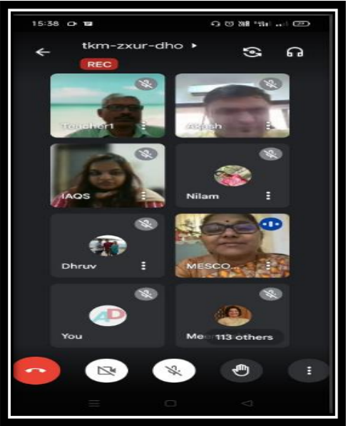
Participants of the session