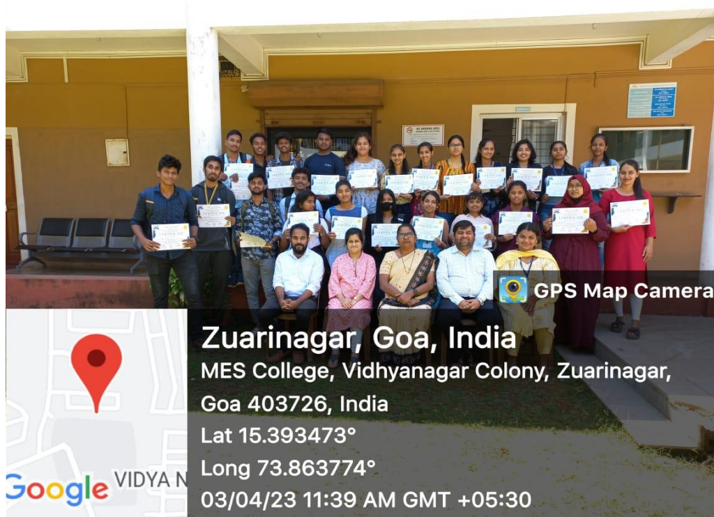
Group photo of participants who completed the certificate course