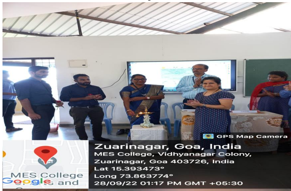
Inaugural function/Introductory session of the certificate Course on Verbal Reasoning