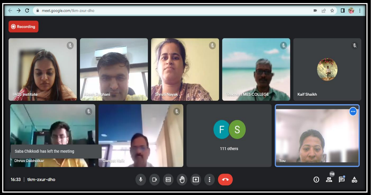
Participants of the session