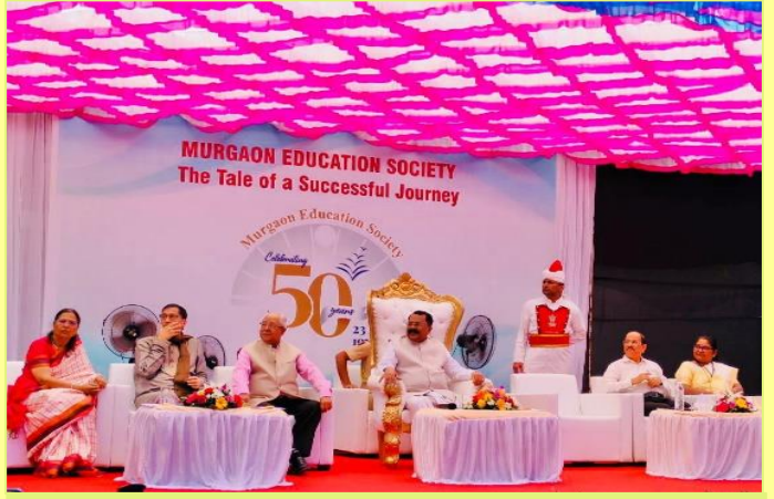
Murgaon Education Society - Tale of a successful journey, Book release Ceremony.