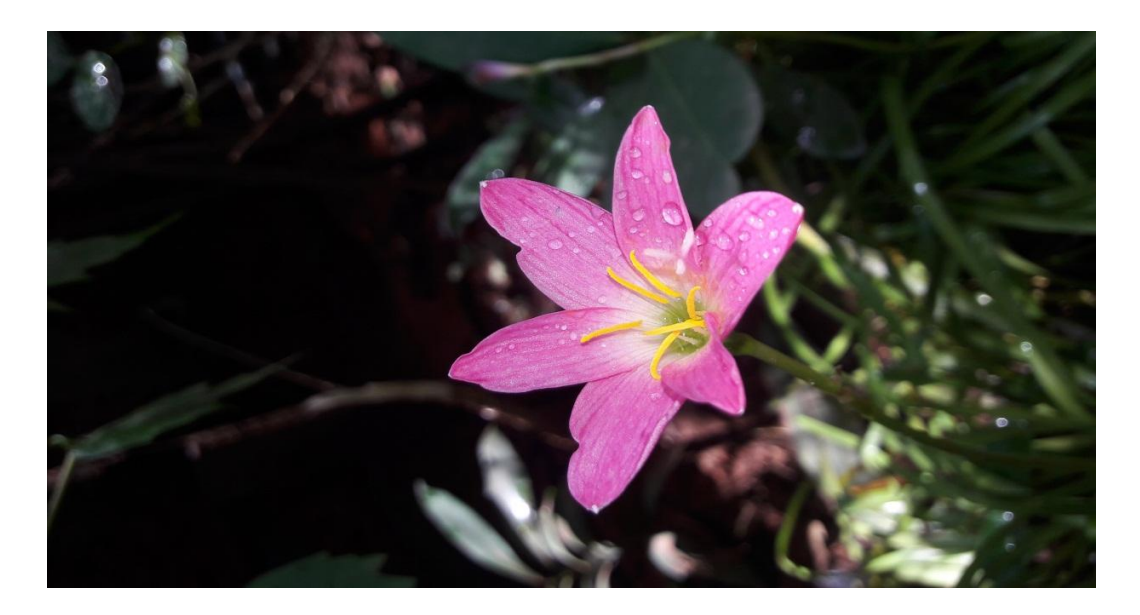
1<sup>st</sup> prize winner