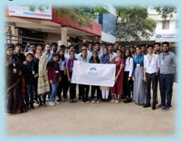
Genesis 3.0- An Intercollegiate Event