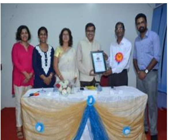
Department of Psychology , along with The Alumni Association of MES College , organized an interclass competition 'PSYCHOBUZZ' on the theme "Quality of life and Mental Health of Adolescents". This event was held on 15<sup>th</sup> December 2017.