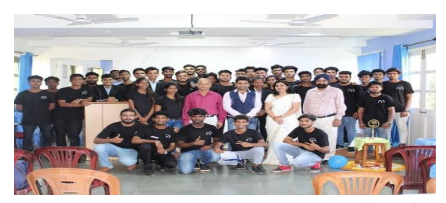
Lakshya XII- National level Inter College Management Event 8<sup>th</sup> and 9<sup>th</sup> January 2018