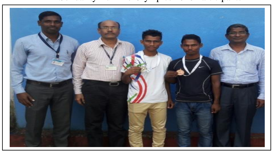
Medal Winners at West Zone Athletics