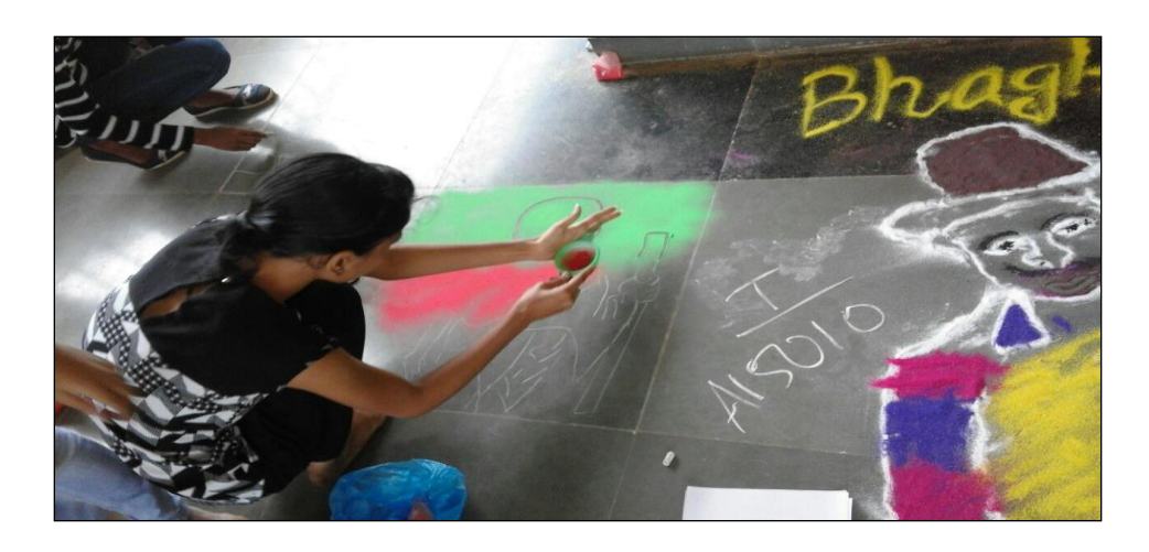
An NSS volunteer seen drawing a rangoli