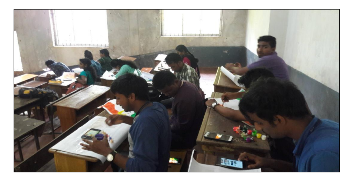
NSS volunteers seen during Poster making competition