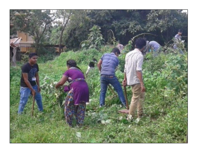
NSS Volunteers seen during regular campus development activity

N.S.S volunteers undertake campus cleaning as part of a regular Campus Development Activity