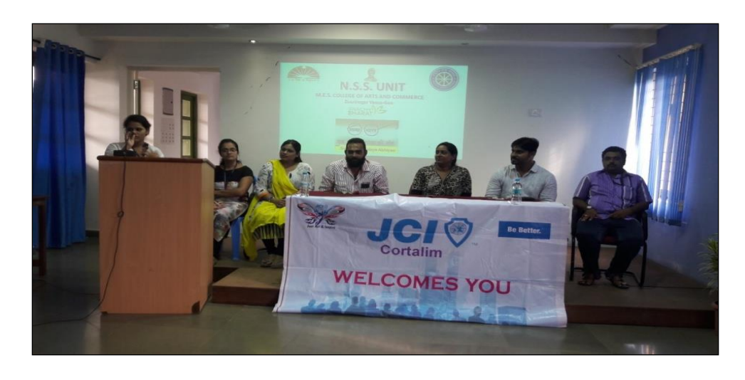
An NSS Volunteer sharing her feedback during the session on Swachh Bharat