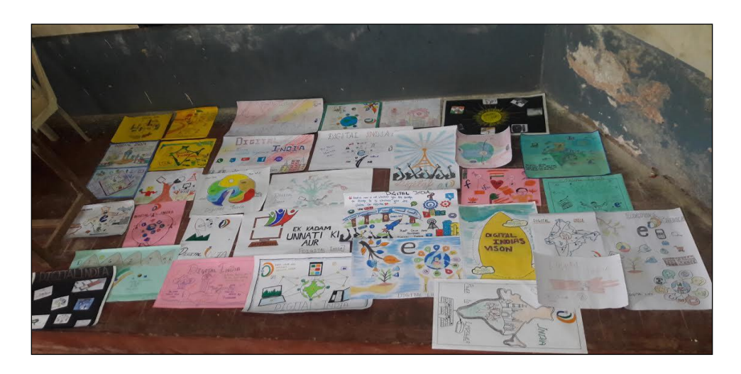
Some of the paintings done by NSS volunteers on display

A painting competition on 'Digital India' was organized for the NSS volunteers. 42 volunteers participated in the competition.