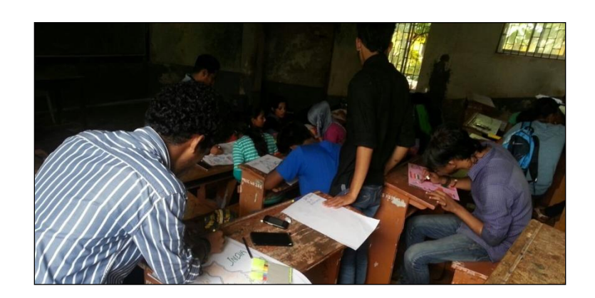
NSS Volunteers seen during painting competition

A painting competition on 'Ill Effects of Drugs' was organized for the NSS volunteers. 25 volunteers participated in the competition.