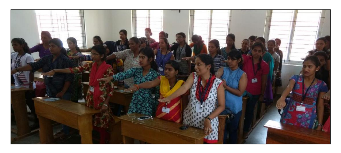
Students taking the Swachhta Oath