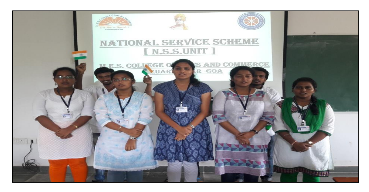
NSS Volunteers seen in the Patriotic Singing Competition

A patriotic group singing competition was conducted for the NSS volunteers on 22 August, 2016 between 01.00 - 02.00 pm in room no 27 of the college premises. Shri. Bhiku V Bhave and Shri. Dattaprasad Shirgurkar were the judges for the competition. 42 NSS volunteers (5 Groups) participated in the competition.