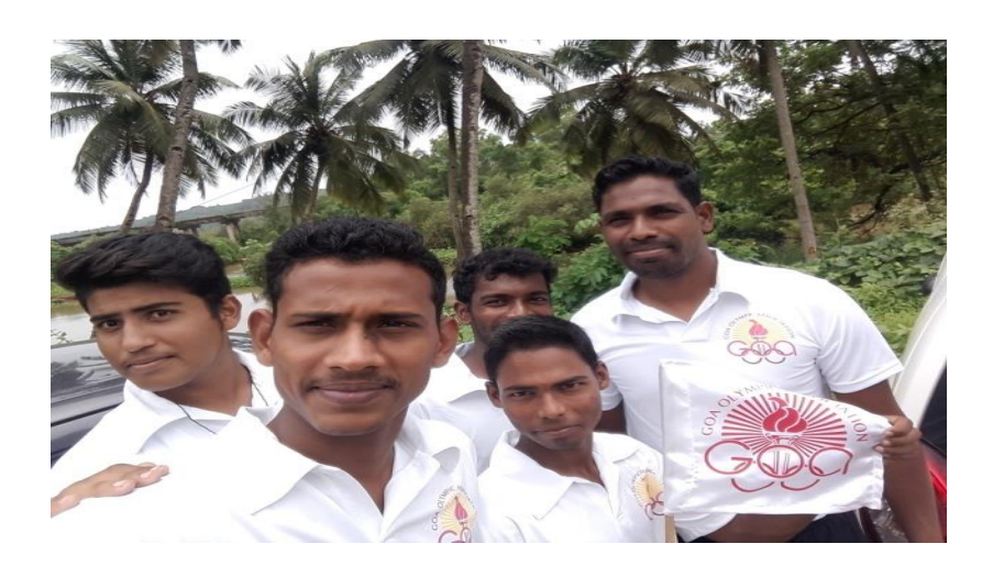
Solidarity Run Rio Olympics 2016 Participants