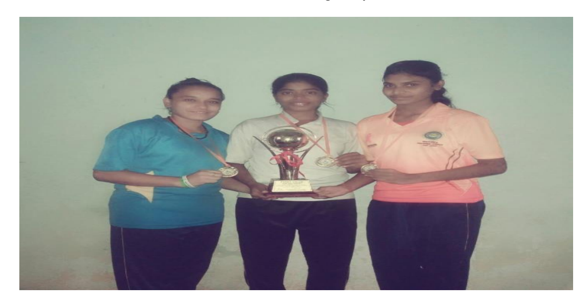
Winners at All India Tennisball Championship