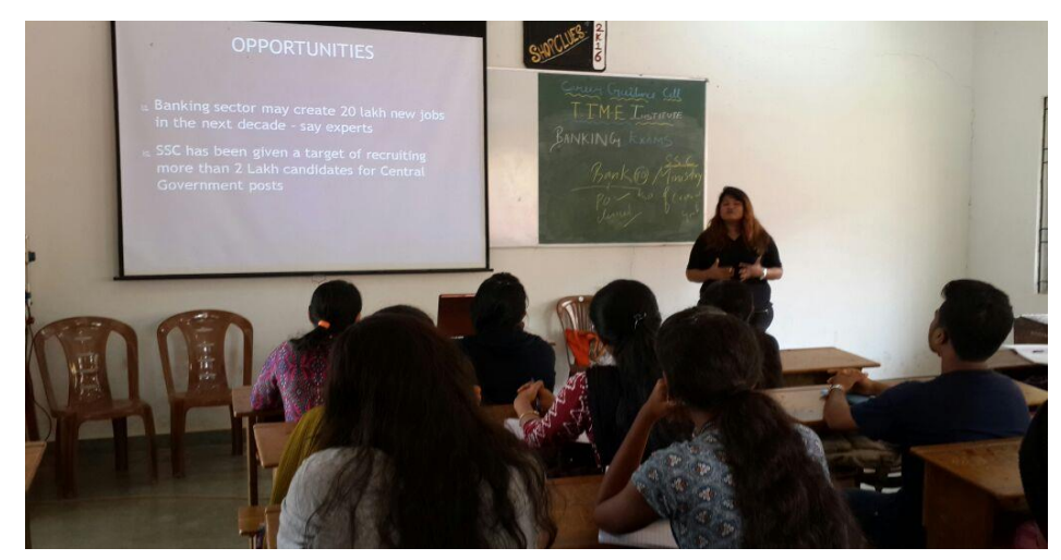
T.I.M.E. Institute, Panaji resource persons giving a talk on banking exams

1. T.I.M.E. Institute, Panaji conducted a talk for the TYBA/BCOM/BBA/BCA students of our college on 11<sup>th</sup> August 2016 at 12.15 p.m. A total of 36 students attended the talk. The resource persons from the institute gave a detailed explanation of the various banks in India, Banking Exam Board, the various banking exams conducted like the Probationary Officers Exam (P.O.) and the Clerical Exam and their tentative dates.