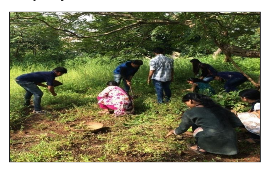
NSS Volunteers cleaning the campus to promote Swachhta

NSS volunteers of all six units cleaned the classrooms, playground and connecting pathways of the college campus