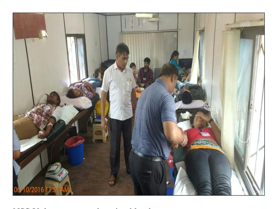
NSS Volunteers seen donating blood

25 NSS Volunteers donated blood in the Blood Donation Camp organized by the TATA Housing Blood Donation Camp on 06 October, 2016.