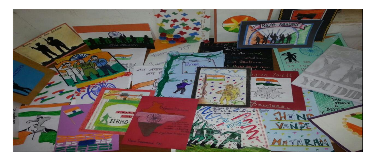
The greeting cards made by NSS Volunteers for the jawans

99 NSS Volunteers made greeting cards which were sent to the jawans who were fighting on the borders.