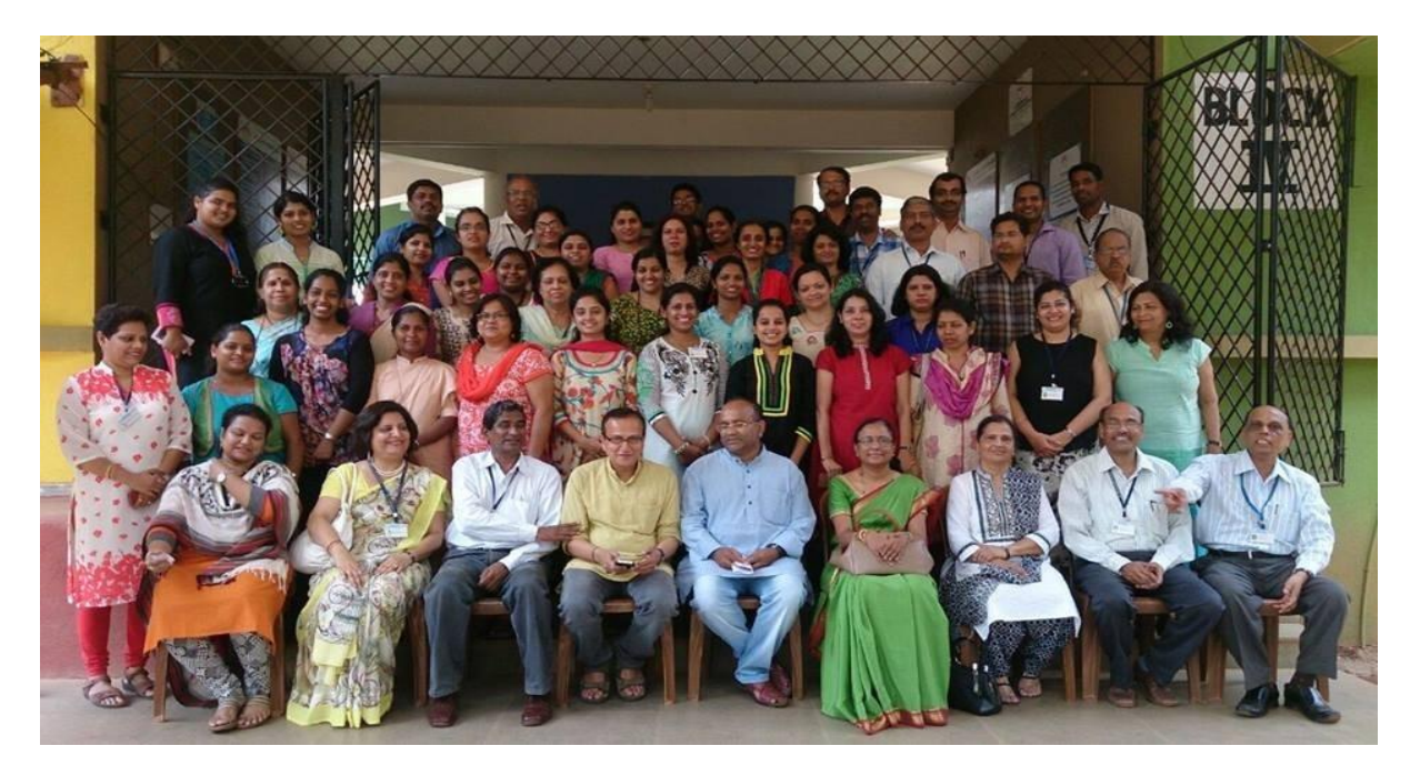
Participants at the state level workshop