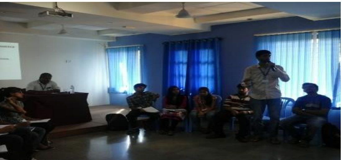
An Inter-Class Debate Competition

'Ban on Pornography' and 'Capital Punishment' on 28<sup>th</sup> August and 18<sup>th</sup> September 2015 respectively.